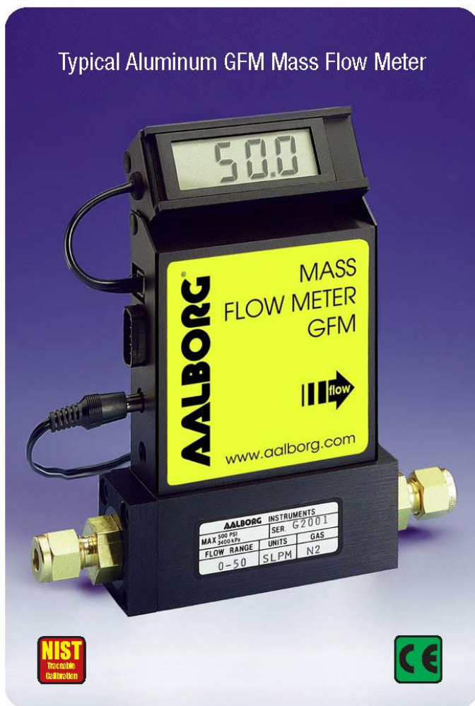
Typical Aluminum GFM Mass Flow Meter

Metered gases are divided into two laminar flow paths, one through the primary flow conduit, and the other through a capillary sensor tube. Both flow conduits are designed to ensure laminar flows and therefore the ratio of their flow rates is constant.